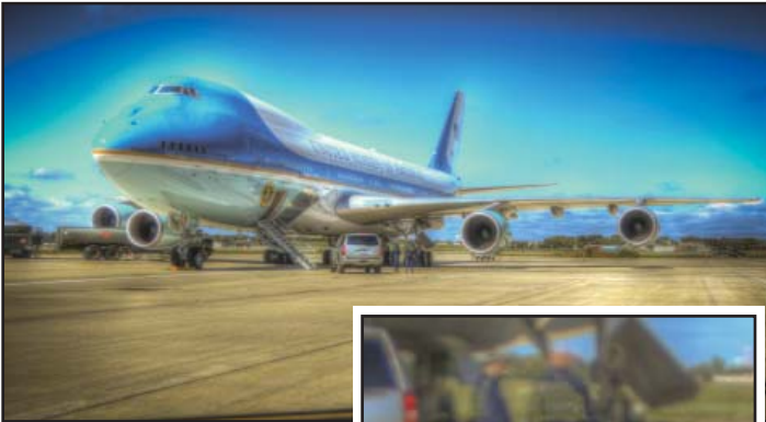
HDR images (detail showing “ghosting”)