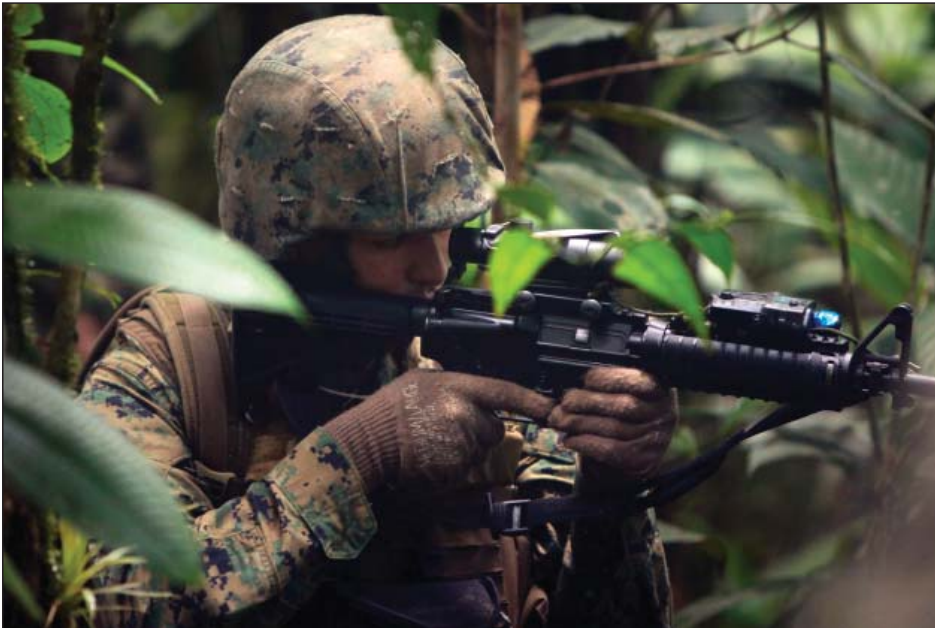
A U.S. Marine with the 3rd Assault Amphibian Battalion patrols an improvised explosive device training trail during jungle warfare training in Colombia Aug. 10, 2010. The unit was deployed in support of Partnership of the Americas/Southern Exchange, a combined amphibious exercise with maritime forces from 10 nations.

Choose several keywords that best describe the visual content of the image or video. Using appropriate keywords will ensure that imagery is more searchable, making it more readily available to the end user.