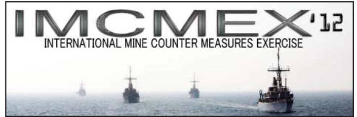
Graphics and logos (above and below)