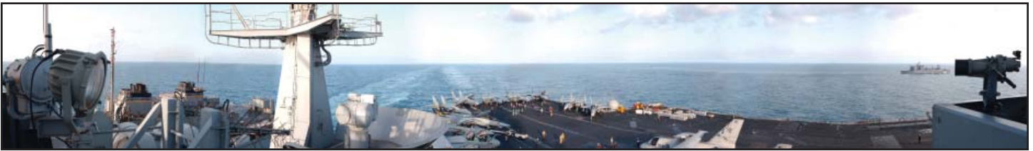
Panoramas (multiple shots stitched together)